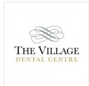
The Village Dental Centre gxdentist.co.uk