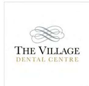
The Village Dental Centre gxdentist.co.uk